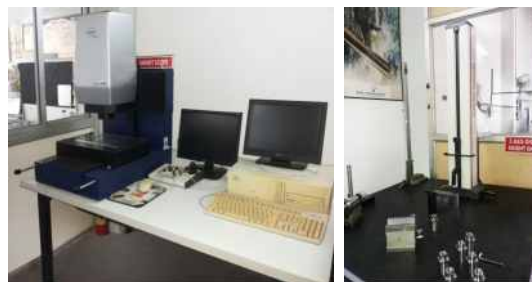
Vision Measuring System