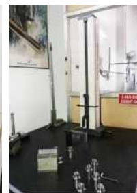
2D Height Gauge of Digi Mahr